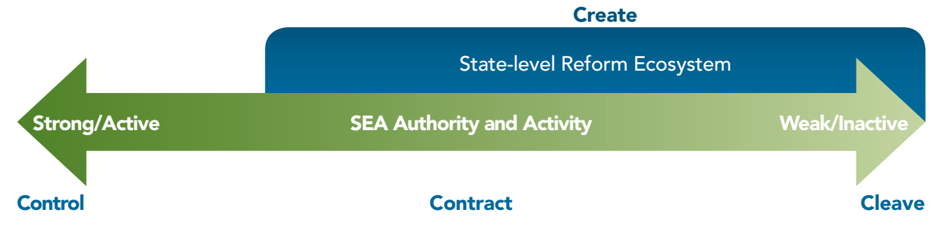
Figure 3. SEA Authority and the 4Cs

Instead of doing "more, better," tomorrow's SEA should do "less, better." The SEA must empower the field rather than trying to unilaterally lead it.<sup>68</sup> Let's look at how this approach might work in practice.